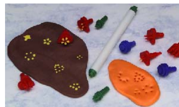
Designer Dot Set