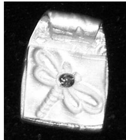
PMC+ pendant with faceted jewel